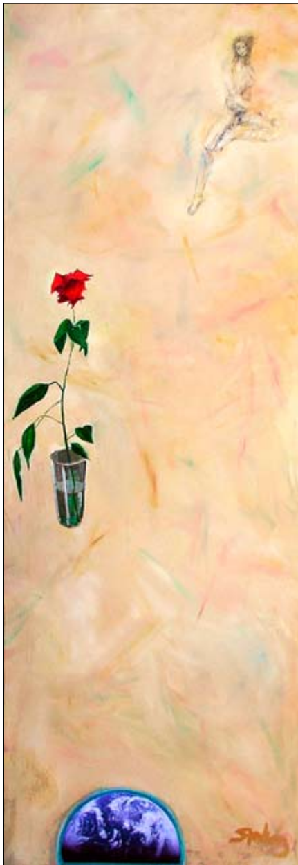
Three Horizons, acrylic, 60 x 24 in.

I look around. The things I see that interest me, I sketch, photograph, or store in memory. I don't always know at the moment why something intrigues me, but I think those that do, strike strong emotions, visual sensations, and a sense of change, of the chaos and order of life.