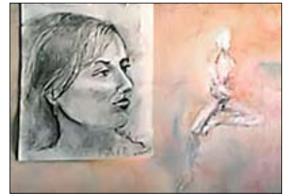
Early sketch for face