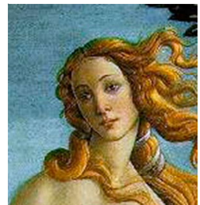
Inspiration for final face.