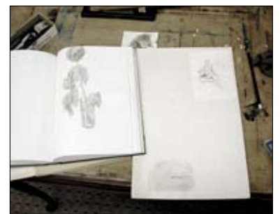
Sketches going into Study