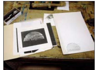
Image that started the work

a sketch of flowers in a glass vase. What drew me to the sketch, I think, were life and eventual death frozen in time, solid and liquid, transparency and mystery.