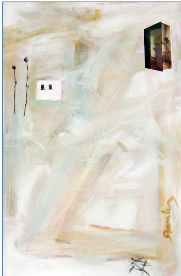
Not Known , acrylic, collage on canvas, 36 x 24 in, 2008