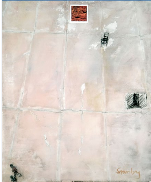
Delineations , acrylic, charcoal, collage on canvas , 24x20 in. 2009