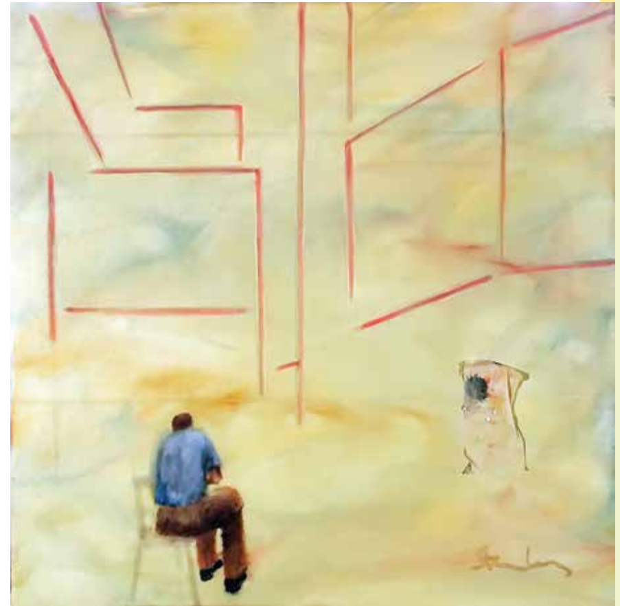
Cover (detail) and below: Senses , 2008, oil on canvas, 24 x 24 inches