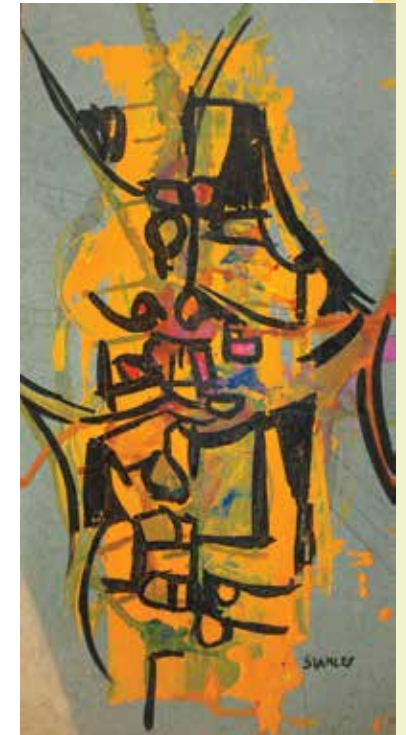
Cheerful , 1966, enamel on board, 24 x 14 inches