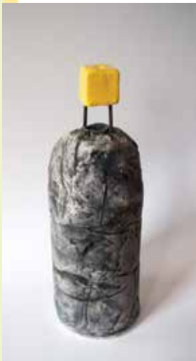
Yellow Cube Dark Vessel Dialectic , 2011, ceramic (earthenware), 11 x 4 inches